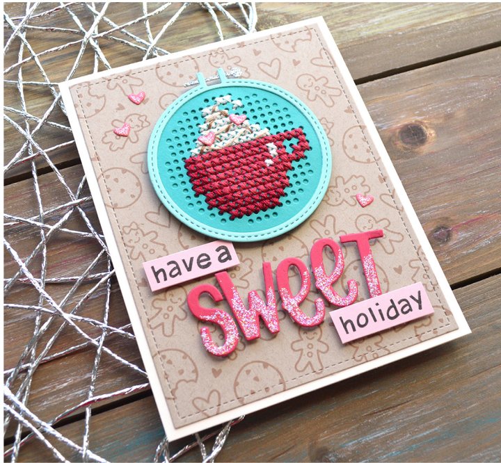
created for lawn fawn by chari moss

Pattern for Embroidery Hoop Lawn Cuts by Chari Moss